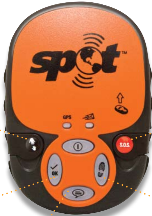
(Shown actual size)

Help/SPOT Assist Ask family or friends for help – or request SPOT Assist.