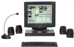
MCC 7500 Console Operator Position

ASTRO 25 Conventional with IP connectivity supports existing QUANTAR® base station sites as well as G-series base station sites. The G-series site equipment is software definable providing the flexibility to upgrade in the future as needs change. QUANTAR stations and G-series stations can co-exist at the same RF site. GTR 8000 stations support either IP connectivity or circuit base connectivity providing flexibility to configure systems as needed.