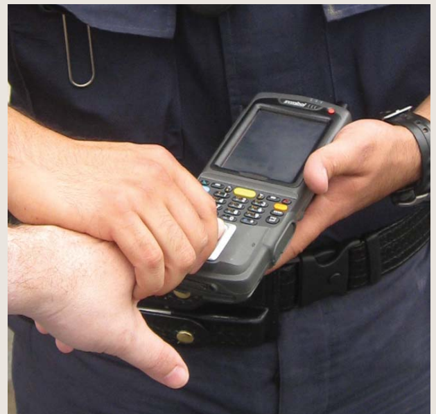
Motorola MC70 Enterprise Digital Assistant with fingerprint reader attachment.