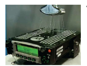
The APX™ 7500 Mobile Radio is rated IP55: protected against dust and low-pressure jets of water.

High and Low Temperatures. Communications and computing equipment must work reliably in extreme temperatures, so manufacturers test their technology under operating conditions of minus 35°C (MIL-STD-810F Method 502.3) and plus 60°C (MIL-STD-810F 501.3). In addition, equipment is often stored under extreme temperature conditions, and is expected to work to specification when put into service. Many manufacturers tests equipment storage in extreme low temperatures down to minus 57°C (also MIL-STD-810F Method 502.3) and high temperatures up to 85°C (also MIL-STD-810F 501.3). These tests are especially important for public safety and enterprise markets, including construction, transportation, mining, utilities and more.